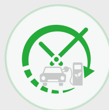
Time of Use Schedule