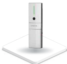
All-in-one Energy Storage System