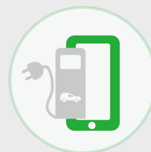
OTA Remote Access